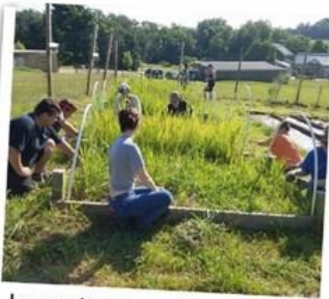
Learning together for the transformation of the world